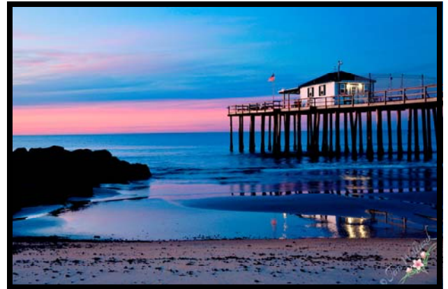
“Morning Music” (above) by Terri Walliczek, of Shrewsbury, won the $200 1st prize.

Over 300 entries were received in the 2010 Freehold SCD Photo Contest. Photographers were asked to capture subjects promoting the beauty and uniqueness of the natural environments found in Middlesex and Monmouth Counties.