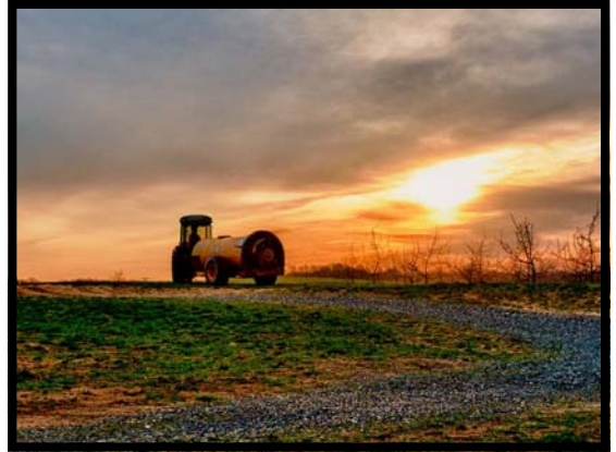
“Farming in Glorious Morning” by Zheng Xu, of Manalapan, was selected as a winning entry in 2011.

We are asking photographers to capture subjects promoting the beauty and uniqueness of the natural environments found within Middlesex and Monmouth Counties.