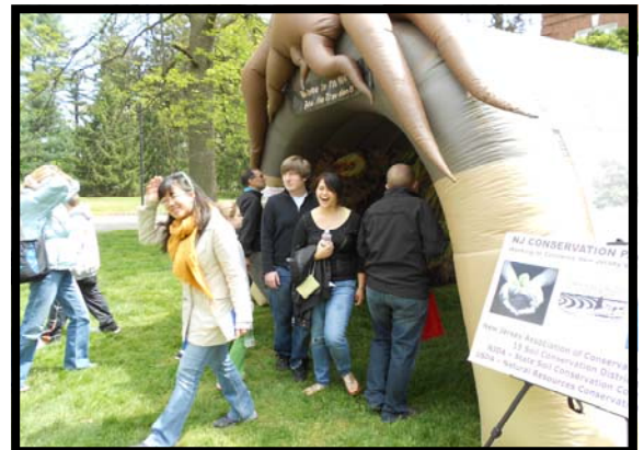
Rutgers Day — Thousands of people viewed the NJ Conservation Partnership's Soil Tunnel at Rutgers Day held in late April.