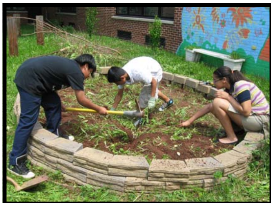
McKinley School students prepare their new pollinator garden in New Brunswick.

Ten new schools were awarded Plants for Pollinators in the Classroom resource kits from Freehold SCD in 2011 joining four returning schools in this unique, hands-on learning experience. Each resource kit included a 2-tier plant growing stand, grow bulbs, starter soil, seeds, lesson plans, teacher resources and gardening tools. Each school received potted perennial plants to jumpstart their gardens.