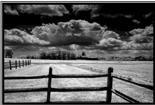
Raymond Salani's 2015 First Place Entry

Wildlife, landscapes, natural resources, agriculture, waterscapes and conservation practices are all suitable subjects.