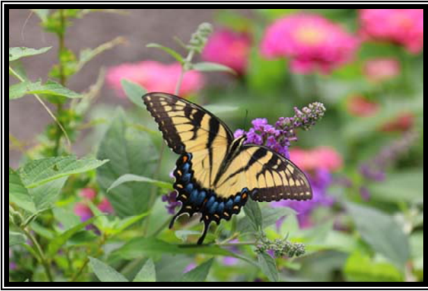
2014 Photo Entry