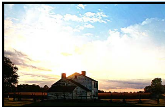
“Sunset Among History” by Jerica Biggs of Freehold, won third place in 2013.

W e are asking photographers to capture subjects promoting the beauty and uniqueness of the natural environments found within Middlesex and Monmouth Counties. Enter the Freehold Soil conservation district annual photo contest and possibly win a prize!