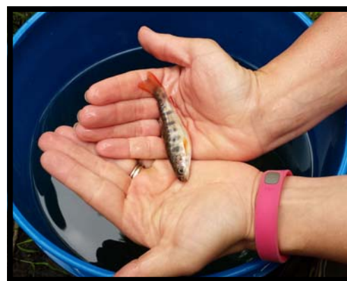
Trout Release Day

Allentown High School Eisenhower Middle School Freehold Intermediate Greenville School Middletown High School South St. Jerome School St. Rose High School Swimming River School Voyagers Community School Manasquan Reservoir Environmental Center Howell Middle School South