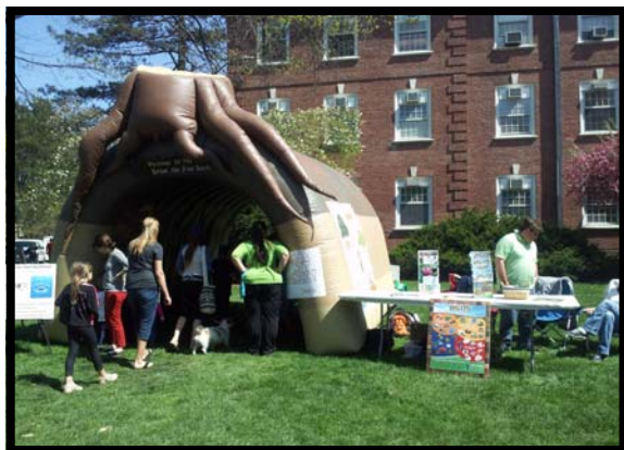
Rutgers Day — Thousands of people viewed the NJ Conservation Partnership's Soil Tunnel at Rutgers Day held in late April.