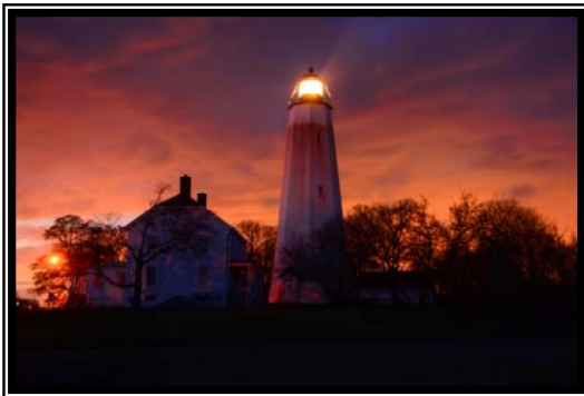
Raymond Salani's 2016 First Place Entry

Wildlife, landscapes, natural resources, agriculture, waterscapes and conservation practices are all suitable subjects.