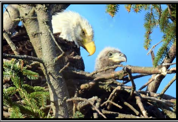
2016 Photo Entry