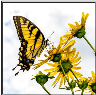
Thomas Maugham 2018 Award Winning Shot

Wildlife, landscapes, natural resources, agriculture, waterscapes and conservation practices are all suitable subjects.